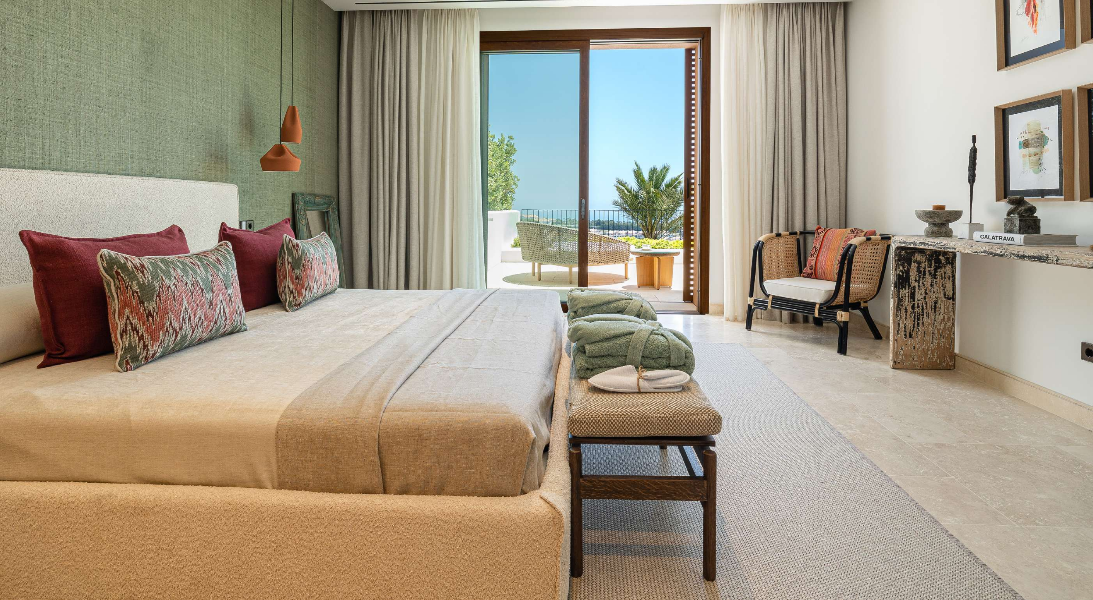
Generously-sized bedrooms, featuring a tastefully design with attention to every single detail.