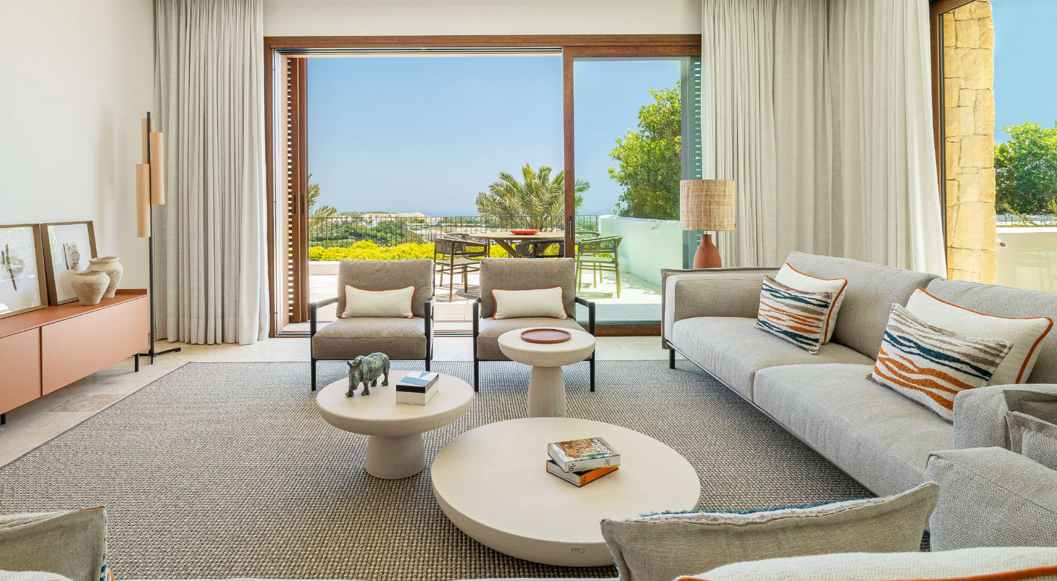
The expansive living area serves as the perfect gathering place for families and friends, offering ample room for shared activities and memorable moments.