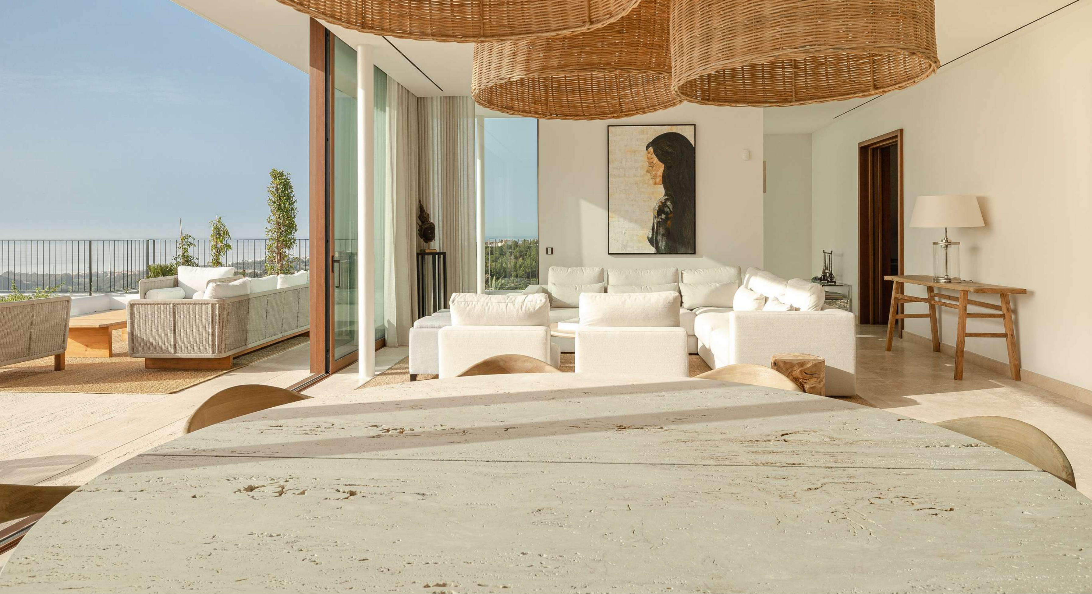
The spacious living area, with open windows merging indoor and outdoor spaces, provides ample room for shared activities and cherished moments.