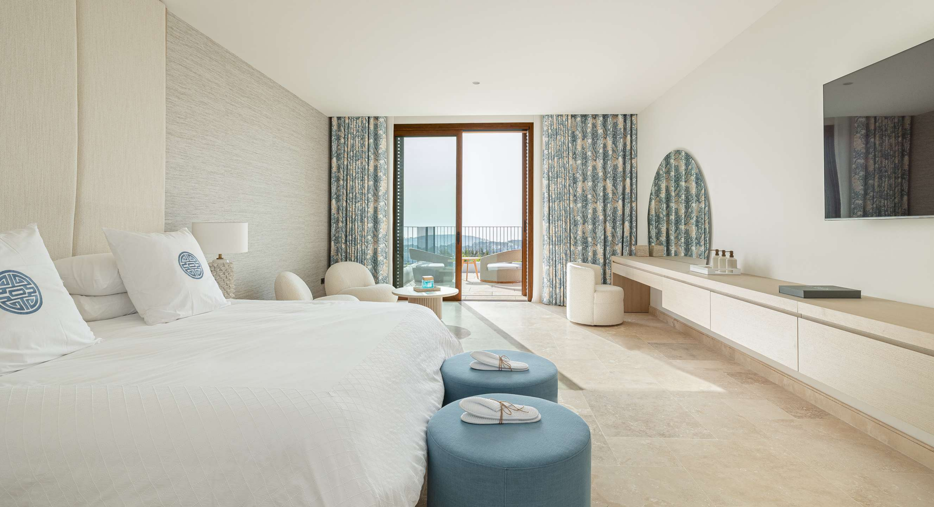
The main bedroom, adorned in pristine white, offers an elegant ambiance with infinite views and abundant natural light, creating a serene retreat.