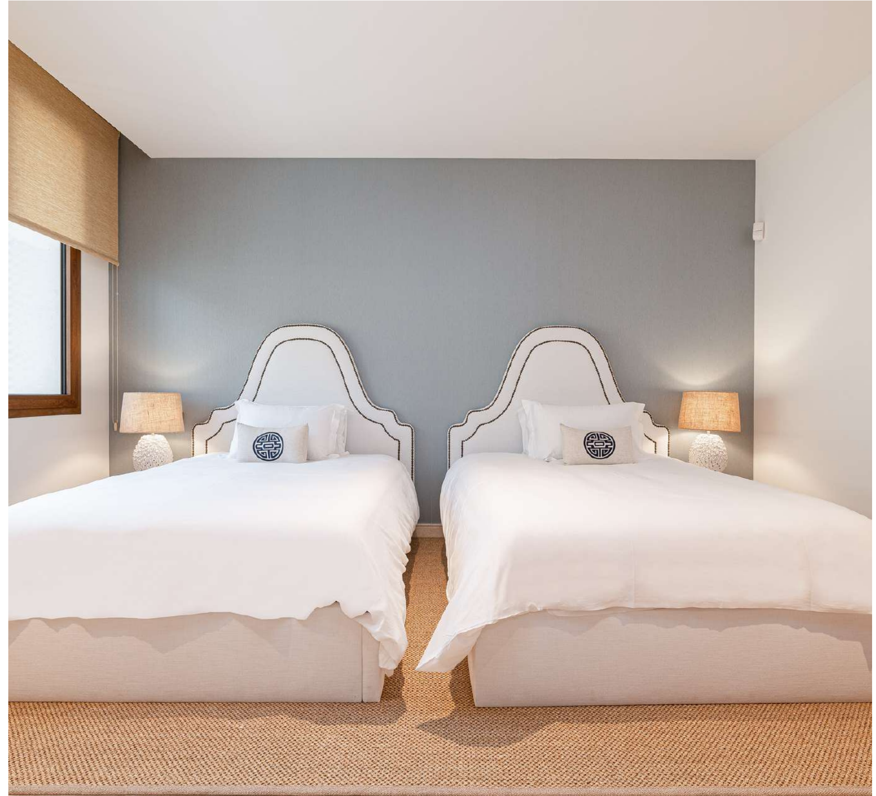
Generously-sized bedrooms, featuring a tastefully design with attention to every single detail.