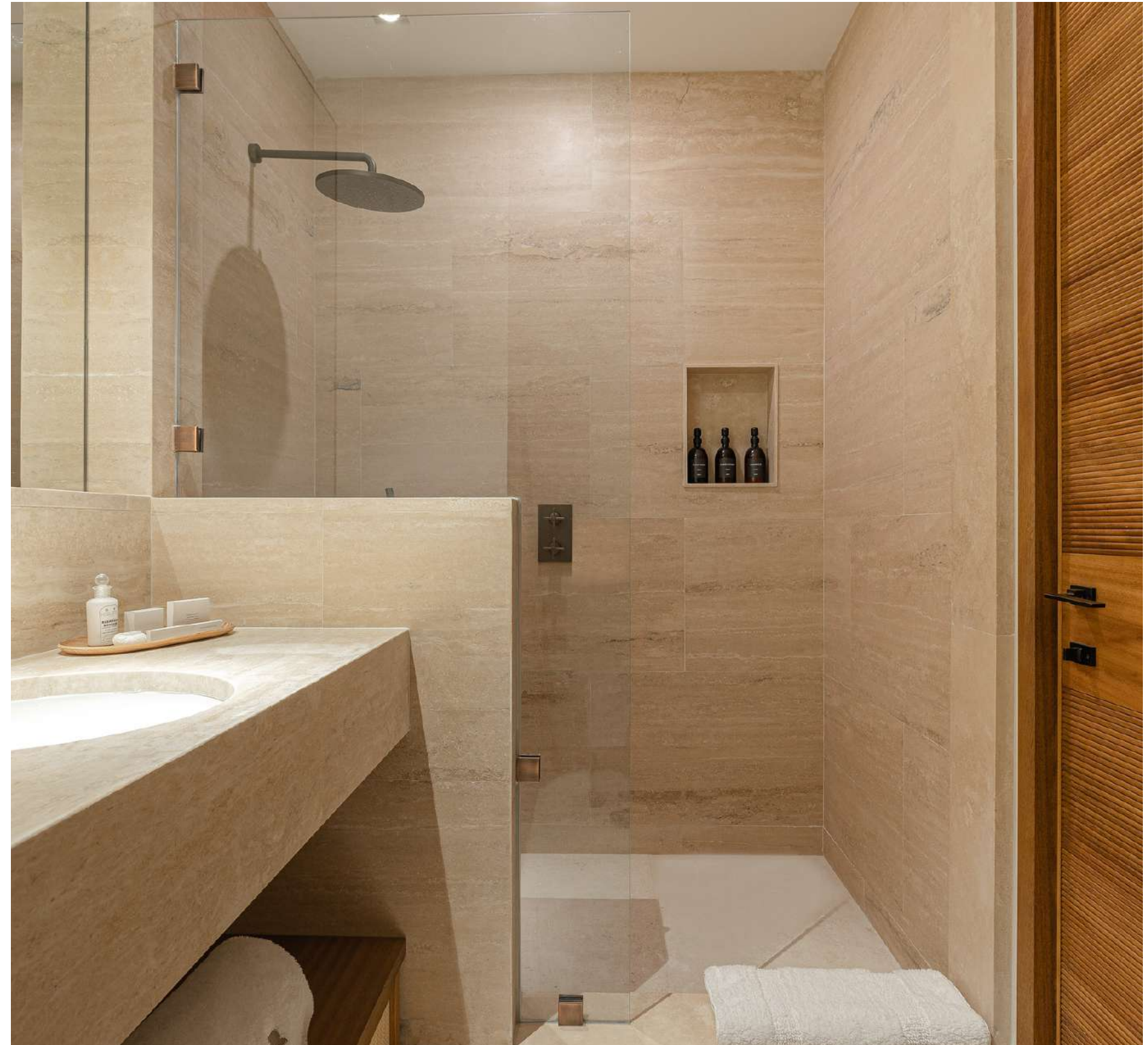
The penthouse boasts 4.5 bathrooms, each thoughtfully designed to provide a luxurious and functional space for residents and guests alike.